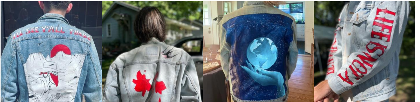
Denim Jacket (back only) - starting at $200