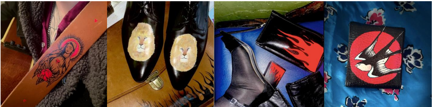
Leather Shoes - starting at $200